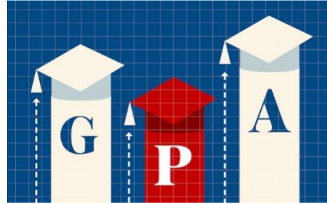
Fig. 8: Learn Calculation of Grade Point Average