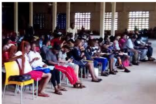
Fig. 2: Screening Exercise for fresh students