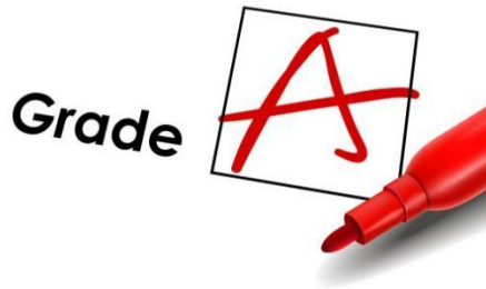
Fig. 7: Akokites are “A” Students