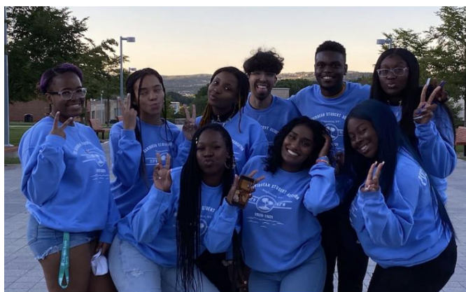
Fig. 16: Members of a Student Club