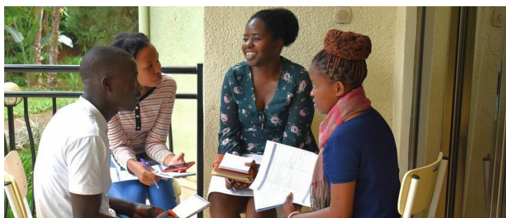
Fig.19: Career, Focus Point Discussion