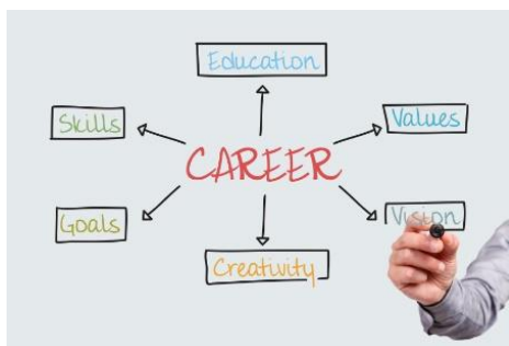
Fig. 18: Empathetic Career Services