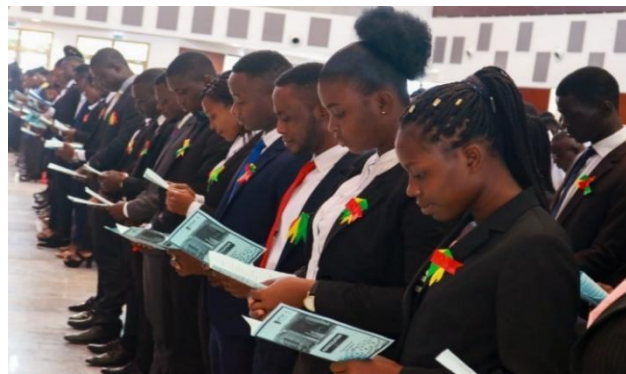
Fig. 4: Matriculation programme