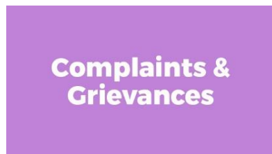
Fig. 13: Grievances do Arise!

At the University of Lagos, we provide environment conducive to learning and personal development for all students. However, grievances may arise within this environment, and it becomes imperative to have a structured mechanism for addressing and resolving student complaints. These enhances academic integrity, ensure student welfare, upholds legal and ethical standards and demonstrates our commitment to excellence, fairness, and student-centeredness.