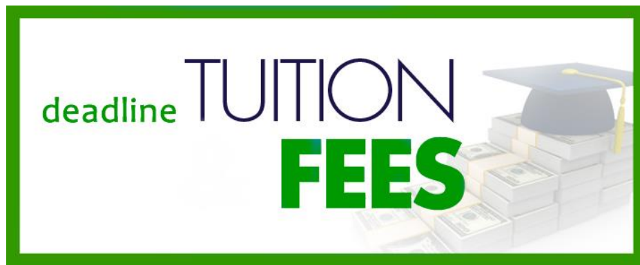
Fig. 9: New Tuition Payment Scheme Approved for UNILAG Students

Get detailed information on tuition costs, fees, and payment options to help you plan for your education at the University of Lagos. Information on the adjusted fees for new and returning undergraduate students can be obtained at https://unilag.edu.ng/?p=24374 .