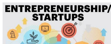
Fig.21: Are You Ready? Start a Business