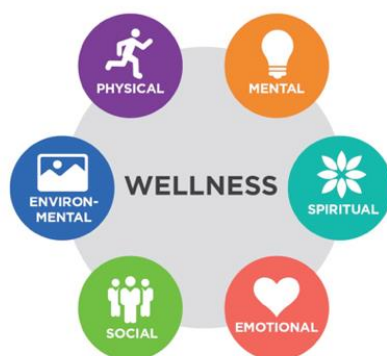
Fig. 11: Your Health is Your Academic Success

The University regulations allow free medical services to all full-time students during period of residence. It also provides free medical service to each employee, his or her spouse and up to four children. Discover the health and wellness resources offered on campus, including medical services, counseling, and wellness programs. ( Read more .. ). Numbers to call for medical complaints are available at https://unilag.edu.ng/?p=15616