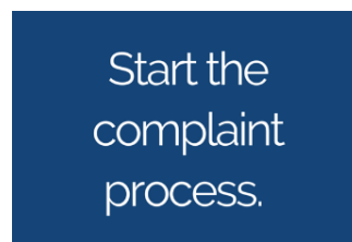
Fig. 14: Act! Get a Resolution