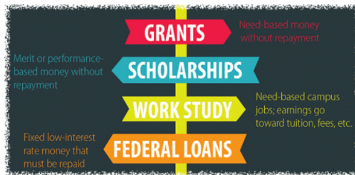
Fig. 10: Explore Financial Support Opportunities Available

The Work-Study Programme (WSP) under the Counselling Unit is a scheme designed to help undergraduate students ( only ) reduce the burden of financing their education. The take-off of this laudable programme; the first of its kind in Nigeria, at the University of Lagos came at a time when the general economic situation in the country dictated that students must look for ways of augmenting their finances. ( Read more .. )