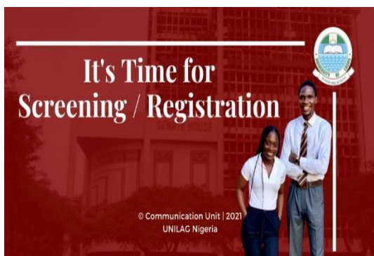
Fig. 1: Newly admitted students

The admission requirements align fully with the high standard set to attract top students into the part time Bachelor's degree programmes. Candidate must satisfy the general and the specific admission requirements for his/her intended programme.