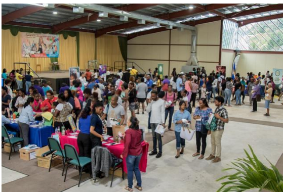
Fig. 3: Orientation programme

This is the first major event when new students are able to meet the Vice Chancellor and Principal Officers, their respective Deans and Senior Administrative Officers. The induction programme into the academic programmes as a bonafide admitted student is the university matriculation exercise ( Read more .. )