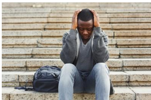
Fig. 12: You are not alone in UNILAG; Talk to a Counsellor!

Learn about the variety of counseling services available to support your mental health and well-being during your time at the University of Lagos. To meet these needs, the Centre offers a variety of services with the ultimate hope of resolving individual problems. The services are in form of individual and group counselling ( Read more .. )